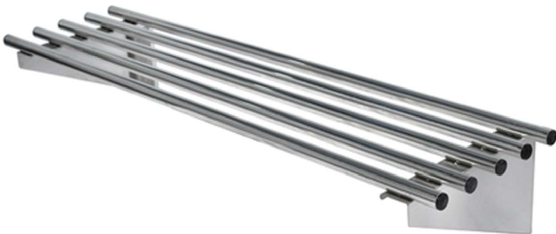
Pipe Wall Shelf