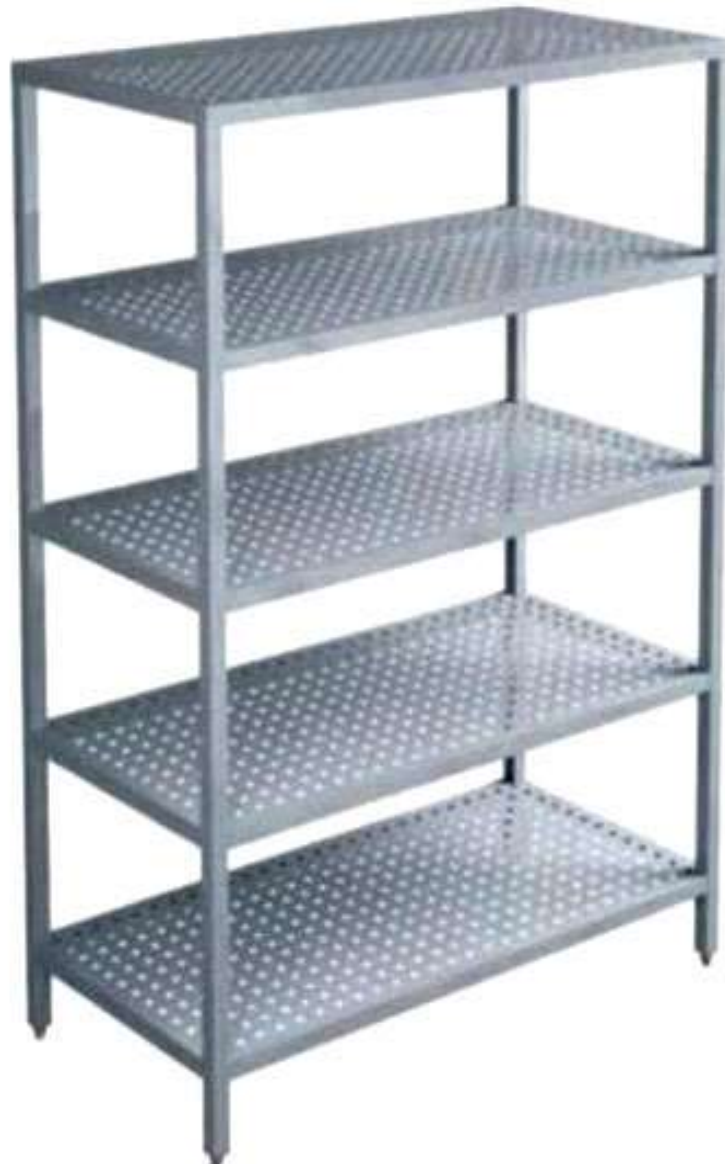
Clean Dish Rack

Durability and hygiene are the two most important things considered while designing and manufacturing the Clean Dish Racks. May it be a Five tier or Four tier Clean Dish Storage Rack for Pots & Pans of your kitchen.