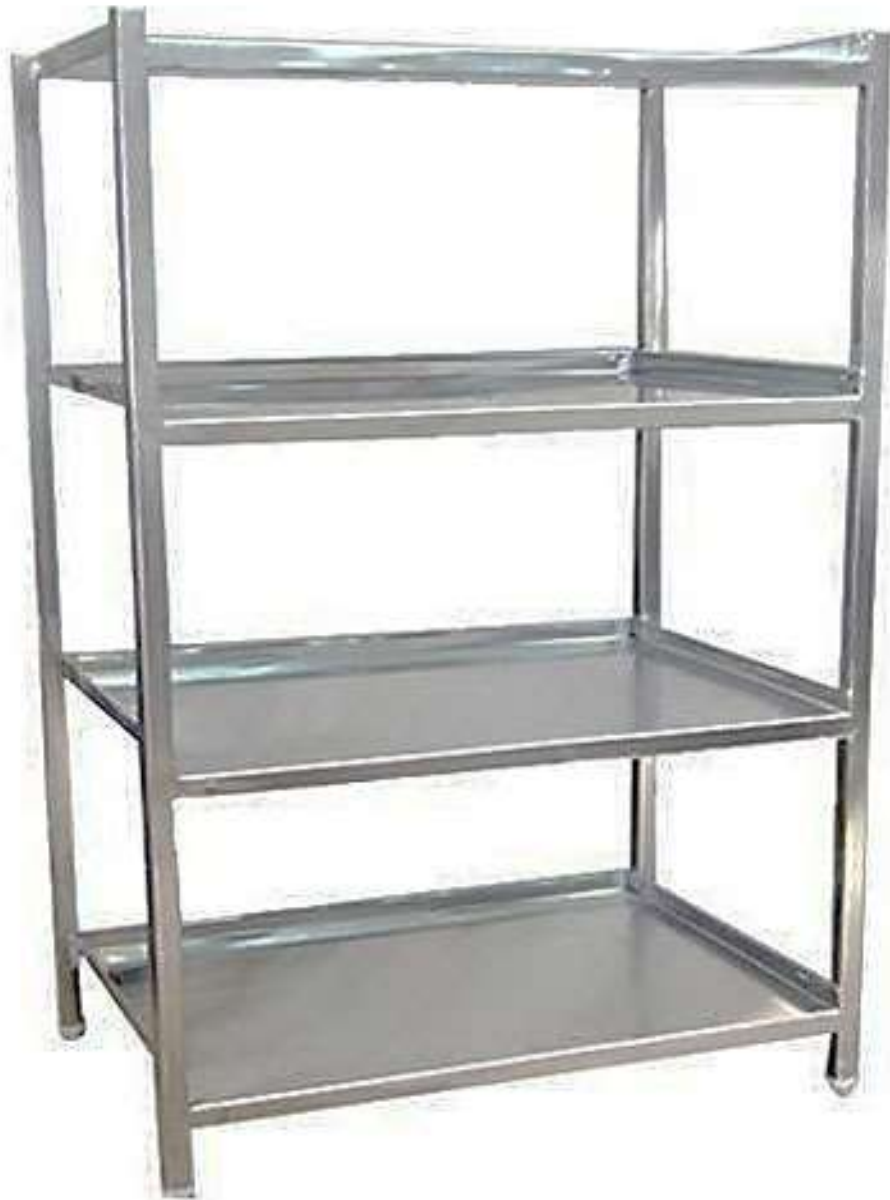
Plain Storage Rack

Durability and hygiene are the two most important things considered while designing and manufacturing the storage racks. May it be a five tier storage rack for dry store / dish storage or four tier pipe shelf for pots & pans or racks required for the cold room.