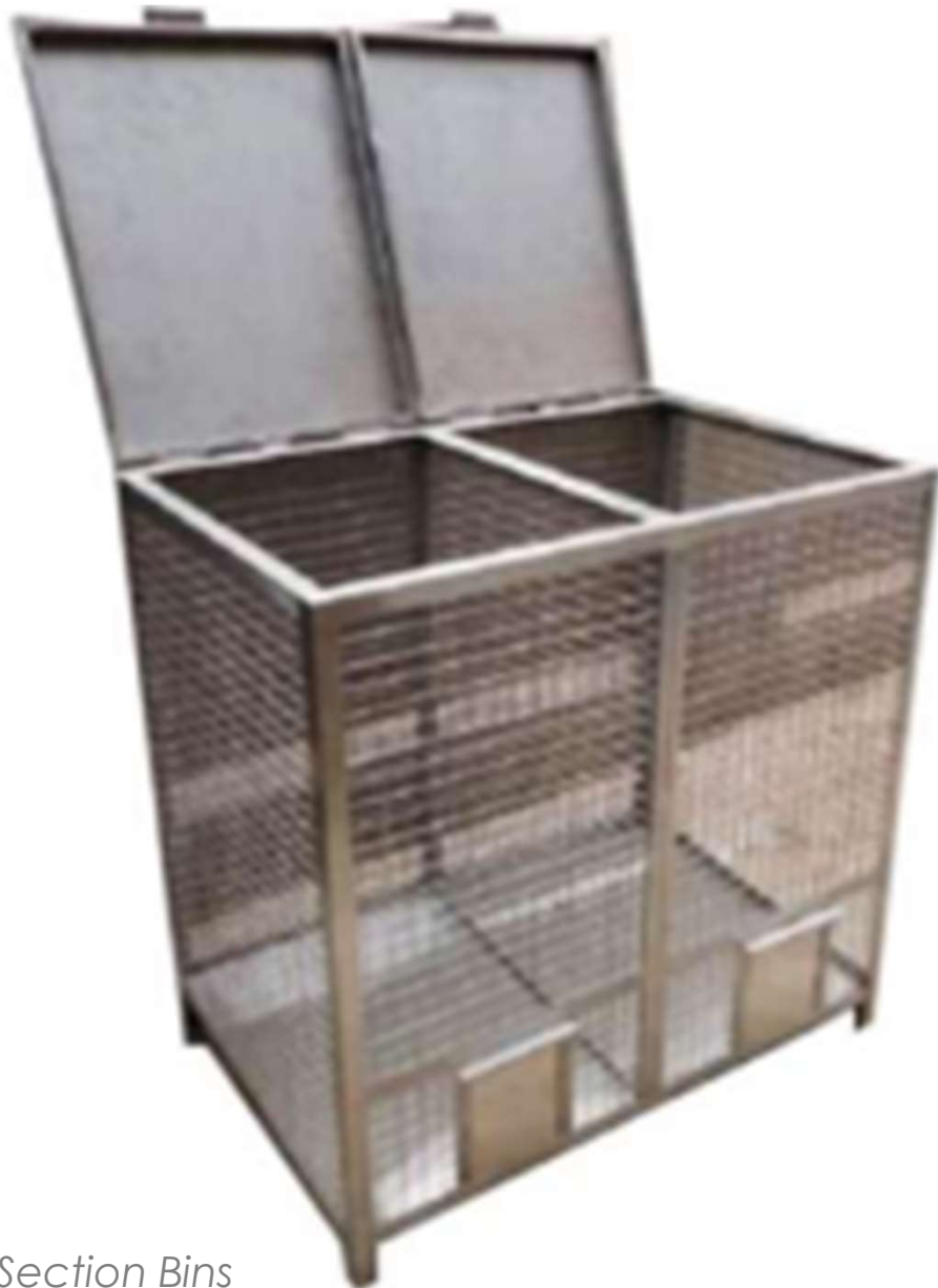
Two Section Bins

Easily empty the bag into the bin by opening the hinged door and take out the required quantity from the opening at the bottom with a sliding door. The construction with round bars help the produce to breath and stay fresh for a long time.