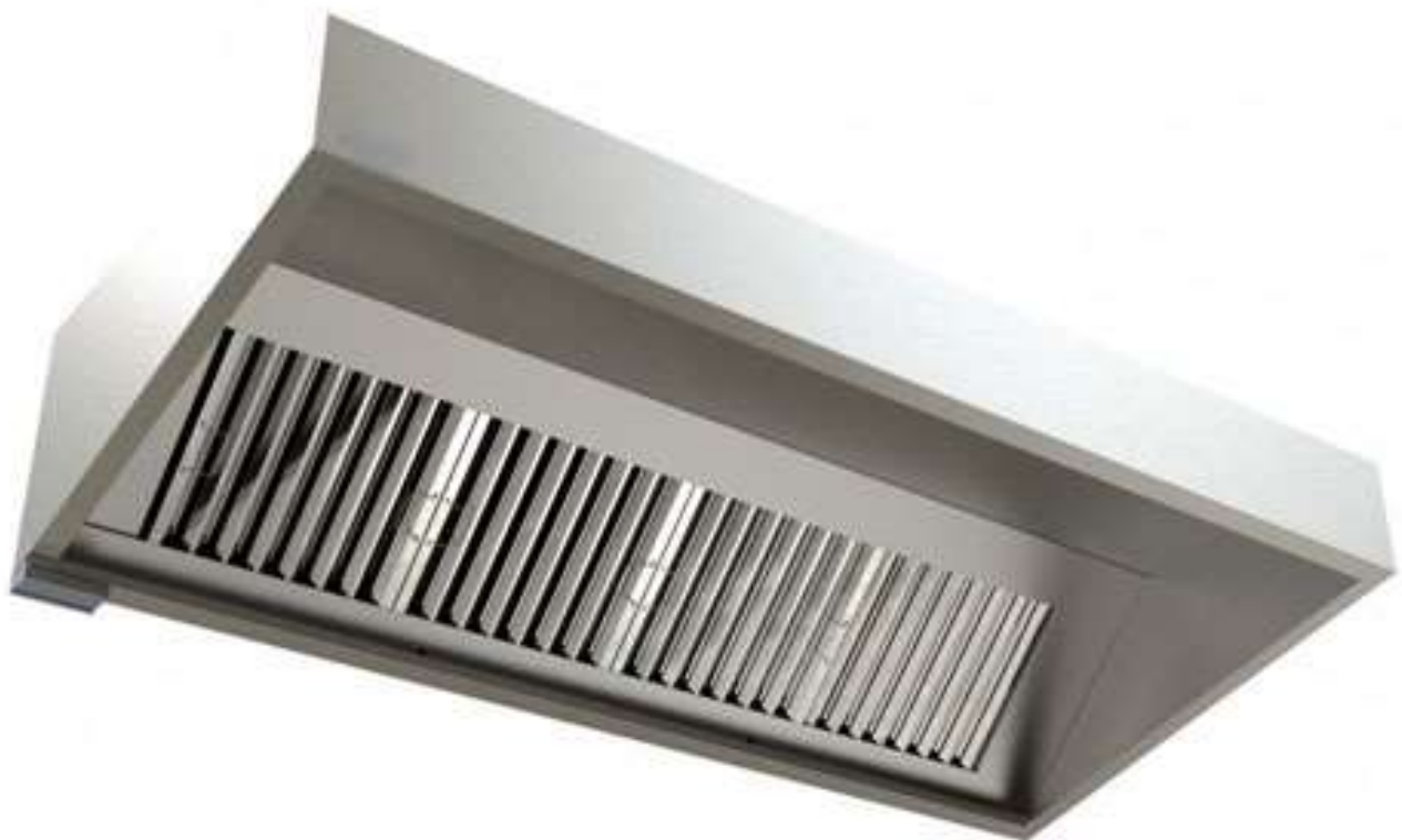
A Exhaust Hood Unit

STAR OPUS has understood this from their years of field experience and developed the Exhaust hood after continuous discussions with the Chefs. The Hot fumes mixed with oil has to travel through the baffle filters, where most of the oil has to be blocked from travelling further into the duct. The blocked oil to be collected in a oil collection tray. Filters and hoods go through harsh and regular cleaning process to remove the oil deposits for this it needs to be durable.