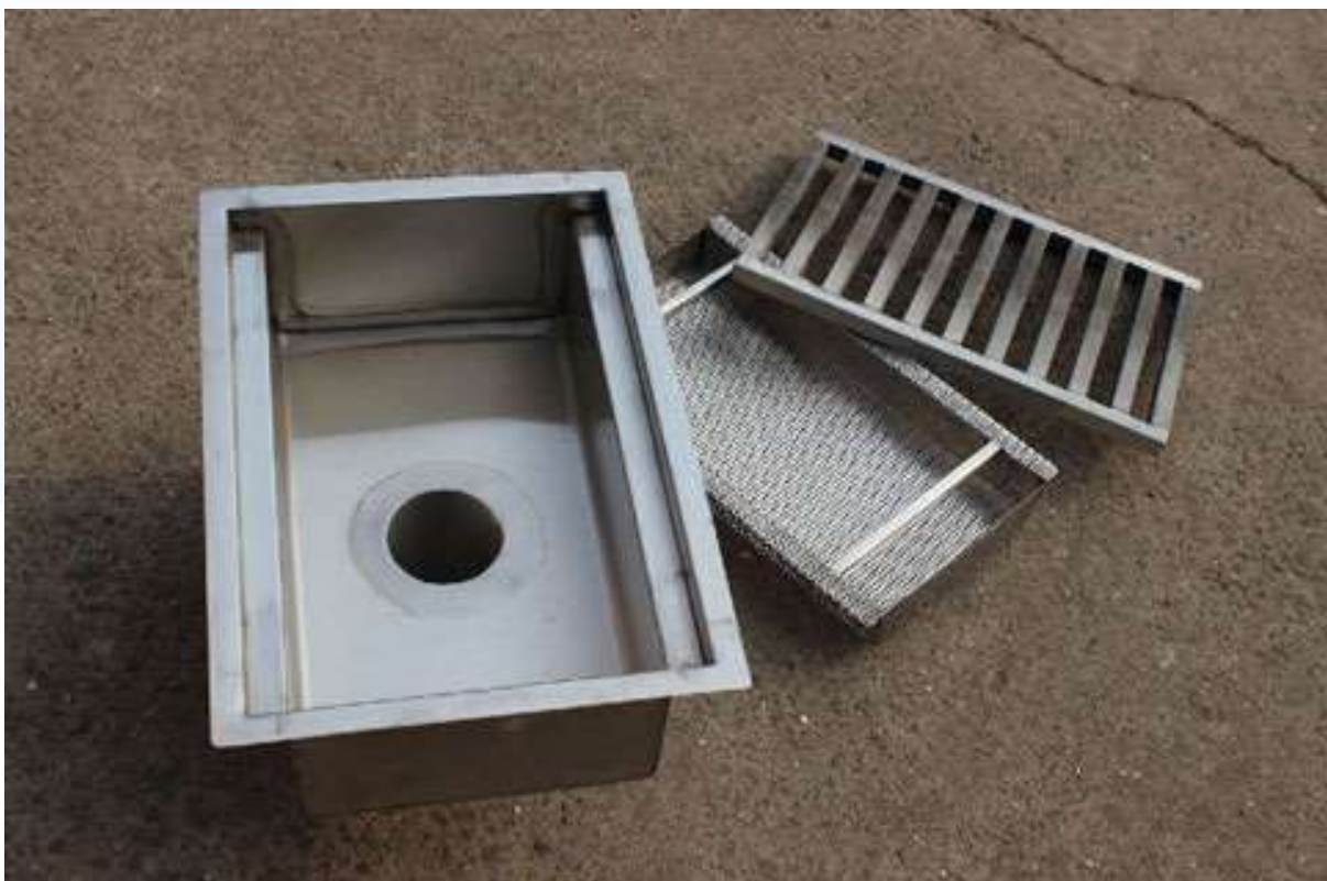
Parts Of Kitchen Drain

STAR OPUS range of Grease Trap and Drain Gratings provide the right solution for this problem. The water from the Sink unit/range to be drained into the drain trough, through a perforated trough so that the particles are arrested, the drain grating fitted on the top is at the floor level and supported by angular structure for strength. While cleaning just pull up the grating, remove the perforated trough and remove the particles. The waste water with the grease travels to a Grease Trap where the grease and any food particles are arrested and water without the grease and particles is allowed in to the main drain. This eliminates the chances of choking in the drain. The removal of the perforated troughs or the grease trap is very easy for the person doing the cleaning job and hygienic.