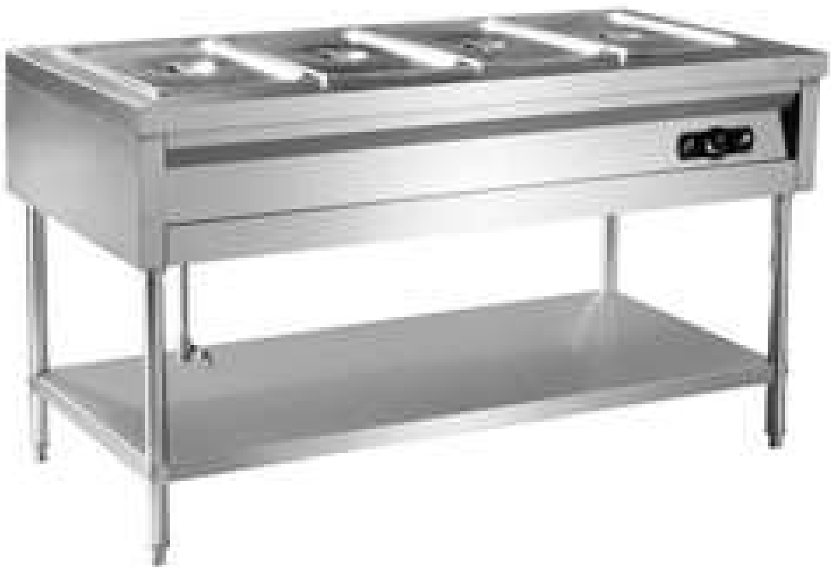
4 Section Baine Marie

The most common problem of heater going defective is because of the dry running in high traffic areas where the water is evaporated and the Baine Marie is put on without the water, we have eliminated this problem by making a well into the tank which will have water even when the Baine Marie is dry and this will ensure the heater is not running dry. Our heaters are also specially made for operating on both water and air.