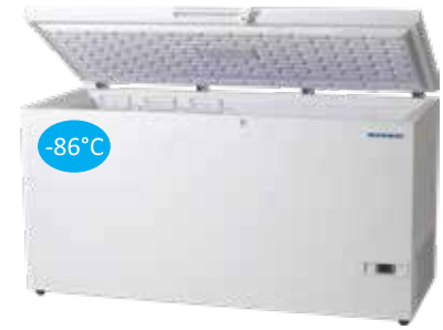
VT 78 / VT 408