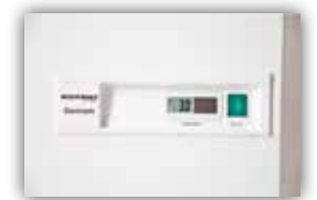
Solar driven display