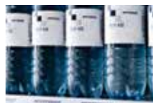
Stable and strong shelves

You have the possibility to choose an accessory lock that prevents unauthorized access to the products.