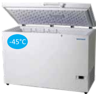
VT 147 / VT 307

These Vestfrost low temperature freezers create the possibility to maintain temperatures as low as -45°C (VT 147 & VT 307), upto -60°C (VT 407) and upto -86°C (VT 78 & VT 408). Supreme stability, reliability, user-friendliness and ease of cleaning make these freezers an ideal solution for laboratories and hospitals. Nature R refrigerant, cyclopentane insulation combined with recyclable materials make the freezers extremely eco-friendly.