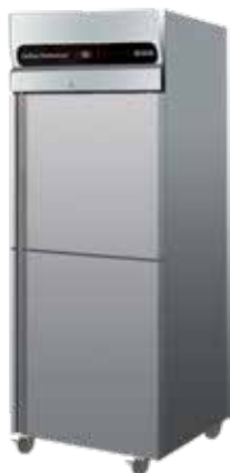
GN 650TBM (New) / GN 650BTM (New)

These rugged refrigerators and freezers in stainless steel from Celfrost come with an automatic defrost mechanism and auto shut doors for energy efficiency.