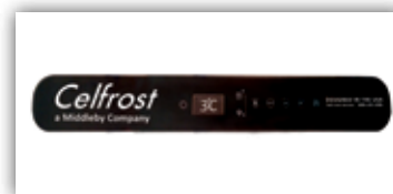
Digital temperature display