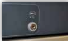
USB Data Collection Point