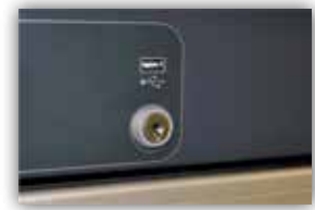
USB Data Logging