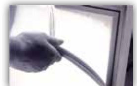
Removable door gasket for easy cleaning