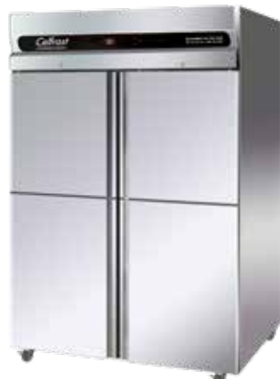
GN 1410TBM (New) / GN 1410BTM (New)