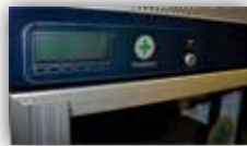
Large Control Panel