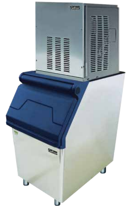
IF-200 on IB-105 Bin