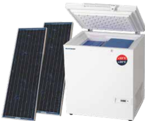
MKS 044 with Solar Panels*

Based on the unique Solarchill ice bank technology, the Vestfrost MKS 044 functions safely without use of energy storing batteries or contaminating fuel. Solar panels supply the necessary power and the icebank provides a reliable temperature in the vaccine compartment – even when the sun is absent for days. The temperature is controlled and maintained via self-regulating convection between icebank and vaccine compartment.