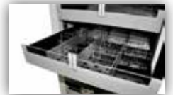
Adjustable Drawers (Optional)