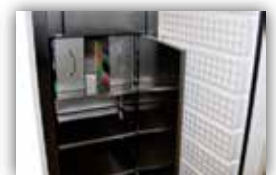
Internal Lids + Shelves