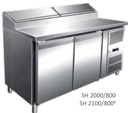
SH 2000/800 SH 2100/800*

Celfrost Professional Prep Counters desserts and more. Mounted on castors and available in 2 and 3 doors, frost free & static with fan assist cooling variants.