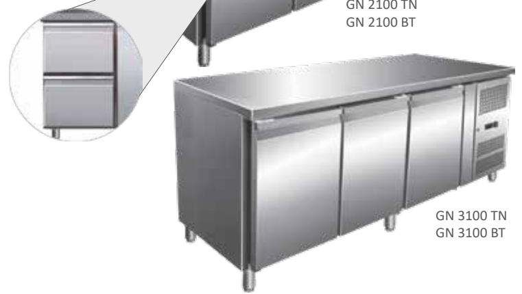
GN 3100 TN GN 3100 BT