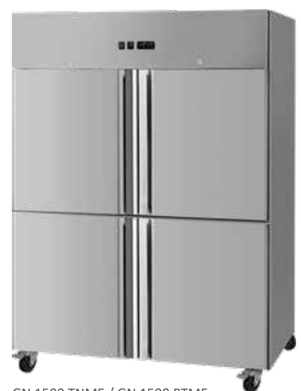
GN 1500 TNME / GN 1500 BTME