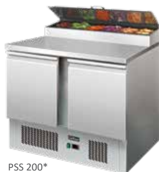
PSS 200* PSE 201* (Also available in 3 doors model PSS 300* & PSE 301*)