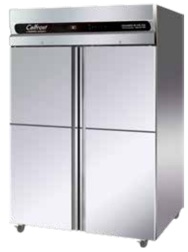
GN 1410 TNM (New)/ GN 1410 BTM (New) GN 1200 TNM*