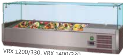
VRX 1200/330, VRX 1400/330