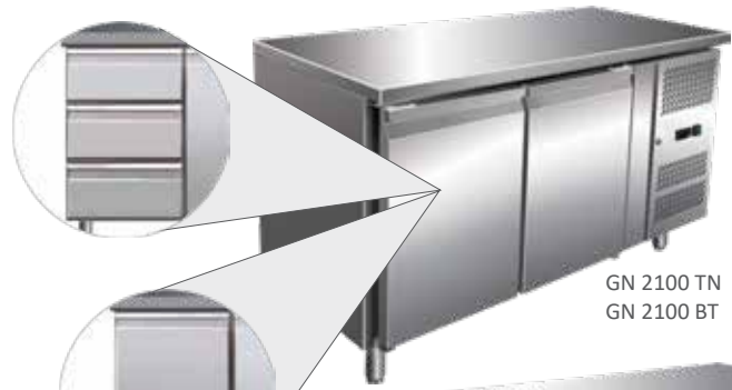
GN 2100 TN GN 2100 BT