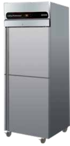
GN 650 TNM (New)/ GN 650 BTM (New) GN 600 TNM / GN 600 BTM*

Celfrost Professional Reach In Cabinets suitable for 2 x GN 1/1 sizes are built in SS304 with reliable Danfoss / Embraco or equivalent compressors, LED temperature display, rounded internal edges for complete hygiene, removable magnetic gaskets for ease of cleaning, self closing doors with heaters to prevent condensation and heavy duty lockable castors. Available in Chillers or Deep Freezers with two or four door options; a choice of Static or Ventilated refrigeration; and in 600 & 1200 ltr. capacities.