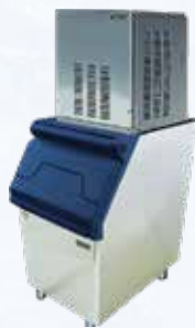
IF-200 on IB-105 Bin