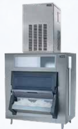
IF-1200 on IB-500 Bin