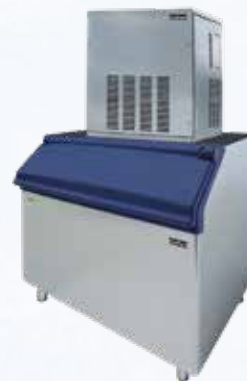
IF-600 on IB-255 Bin