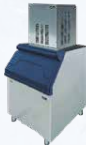
IF-330 on IB-205 Bin