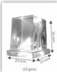
Dice Ice Cube