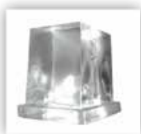
Dice Ice Cube