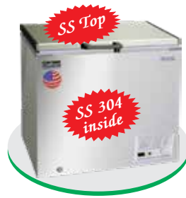
CF-330 SS (Also available in Double Door CF-435 DD SS)