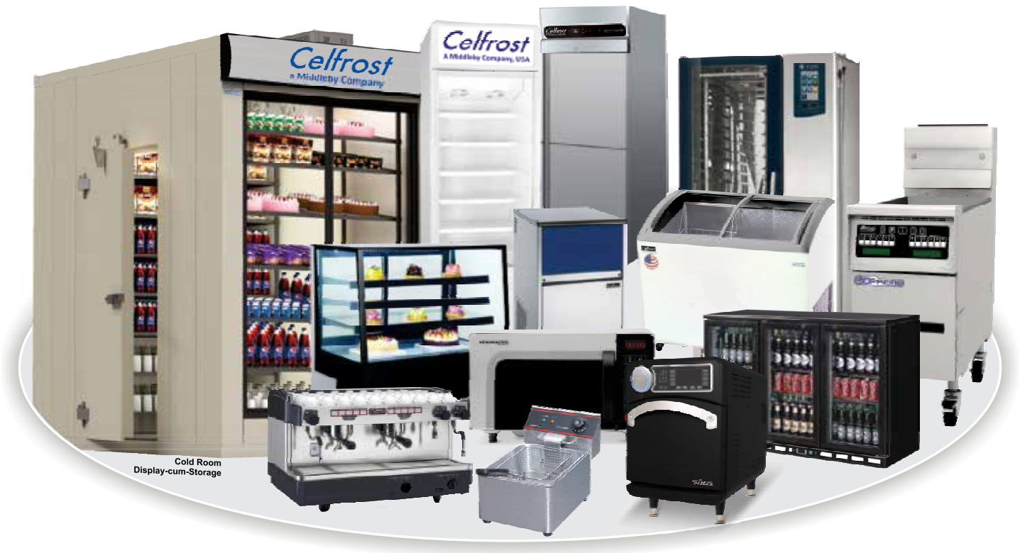
Cold Room Display-cum-Storage