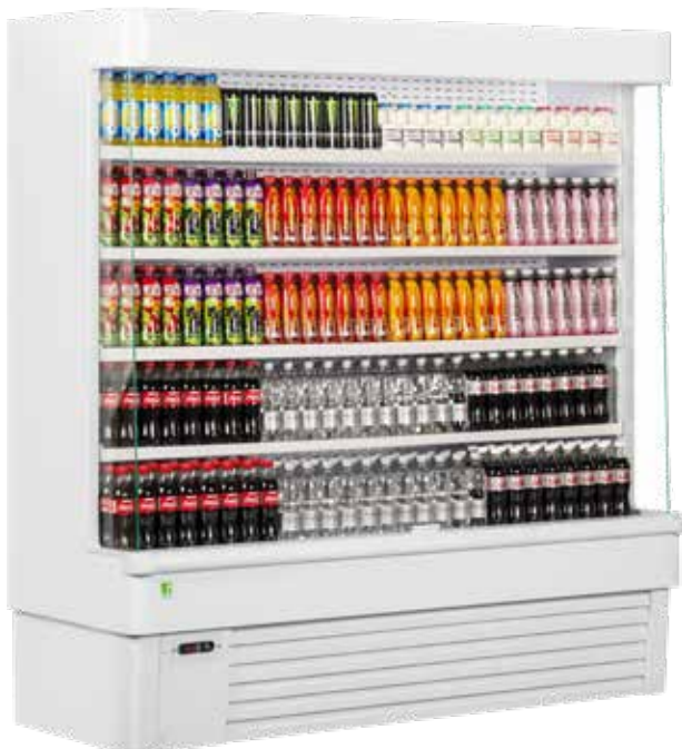
Remote Multideck Chiller (Close door option available in Chiller & Freezer)

Accessories optional, product image are for representation, actual product might vary.