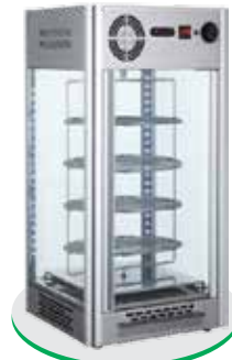
FSDCR 108/FSDHR 108