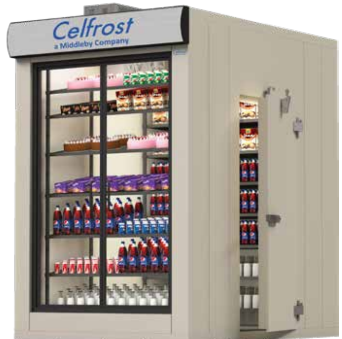
Display-cum Storage Coldroom