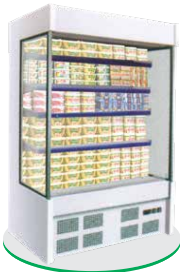
HTS 1000 / 1200 / 1500