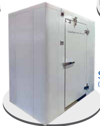
SpaceSaver (Mini Cold Room)