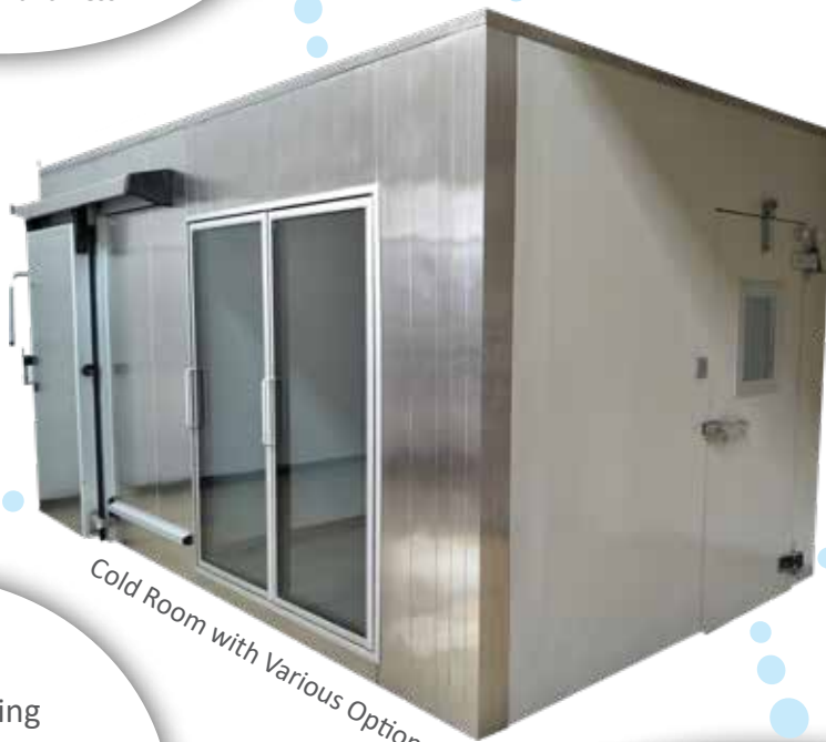
Cold Room with Various Options

Aesthetic, efficient, durable, suitable for heavy-duty usage. Flush-fit with FRP door perimeter with auto closer. Overlap & double leaf door options available for all applications