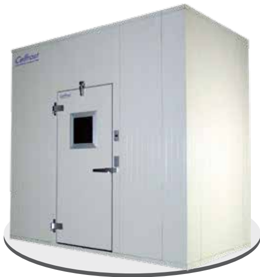
Cold Room (20°C to -40°C)

The world's finest ideas in cooling & preservation!