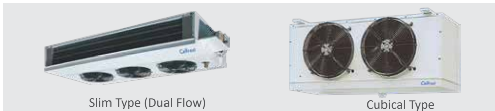
Slim Type (Dual Flow)