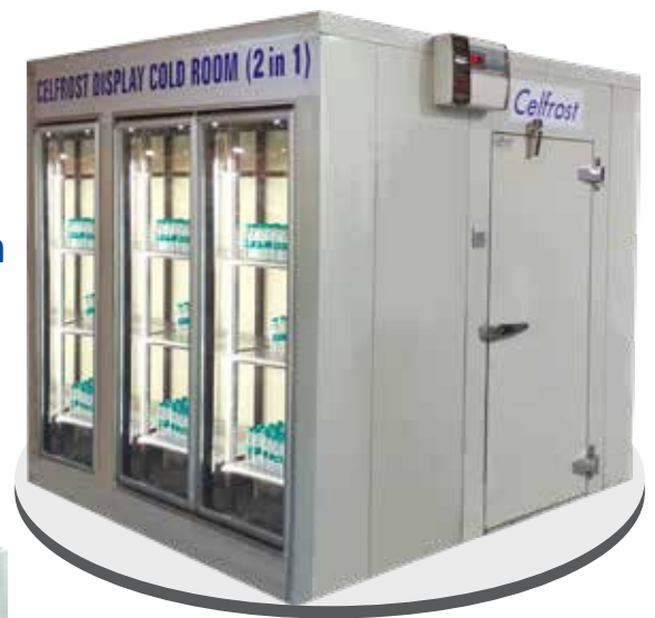
Display Cold Room (Front side display back side storage) (2°C to -5°C)