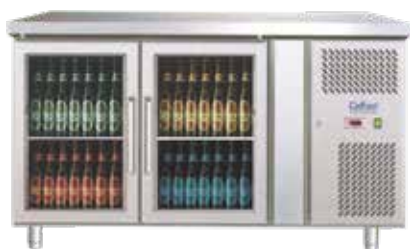
Undercounter Back Bar (GN 2100 TNG)

Elegant yet reliable Undercounter Back Bars made in sturdy stainless steel that are designed to enhance the efficiency of professional bartenders. Perfect for showcasing bottled and canned drinks and giving you high capacity & high visibility storage and display options.