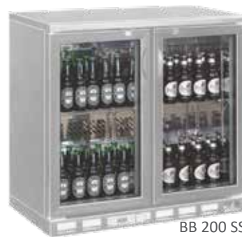
BB 200 SS