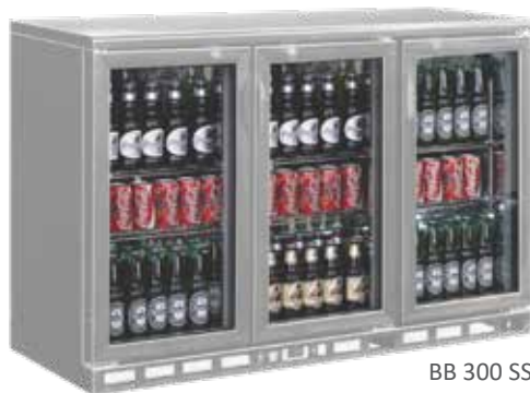
BB 300 SS

High performance Back Bars with refrigerated display, available in elegant black colour and stainless steel that can be specified as part of a complete bar solution or individually.... giving you endless possibilities in bar design. They create maximum display area and allow rapid restocking and cooling. Black Back Bars are highly cost-effective too.