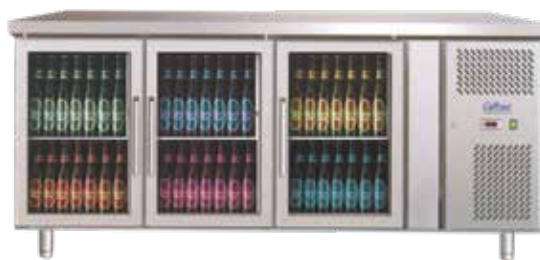
Undercounter Back Bar (GN 3100 TNG)